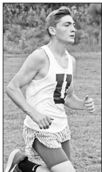
Union County Cross Country at Gilmer's Clear Creek Middle School.